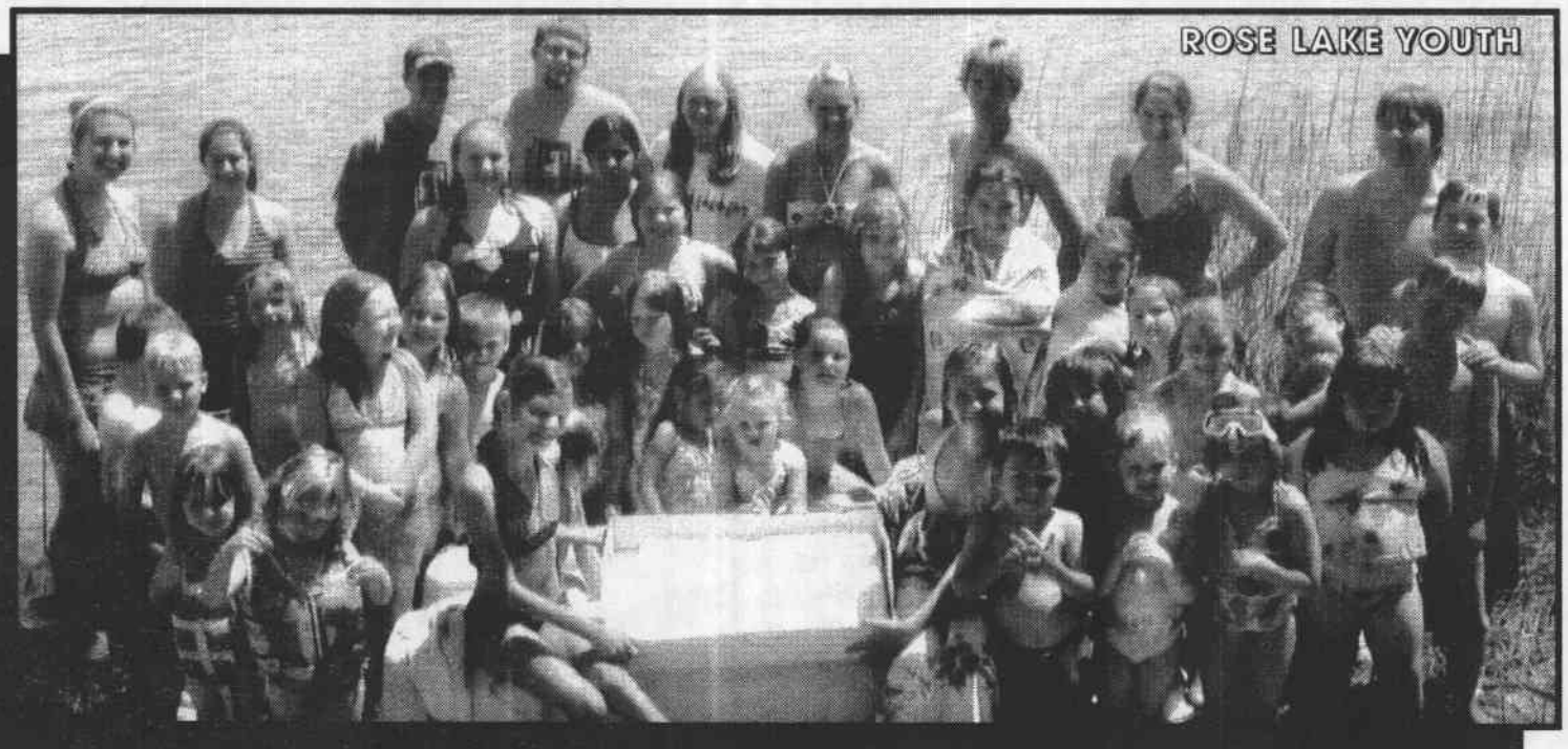
ROSE LAKE YOUTH