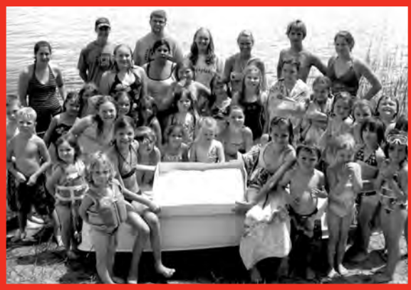
Rose Lake Youth Campers celebrate the 60th anniversary of the camp during the summer of 2008.

Funds: Kent-Bonsall Family Fund and Rose Lake Youth Camp Fund $4,000 Grant